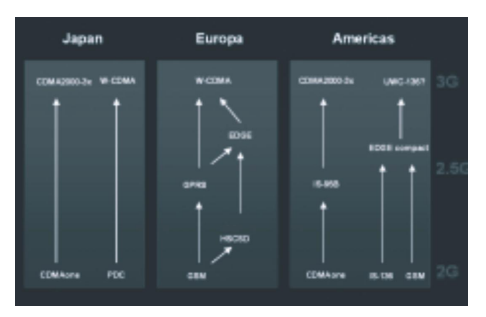
Fig. 1. Evolution of Networks.

The migration path towards UMTS is rather different within the different regions of the industrialized world. Whereas Japan follows a straightforward strategy from first digital cellular systems towards UMTS or W- CDMA the legacy systems in the Americas and in Europe require a more evolutionary approach including backwards compatibility, Fig. 1.